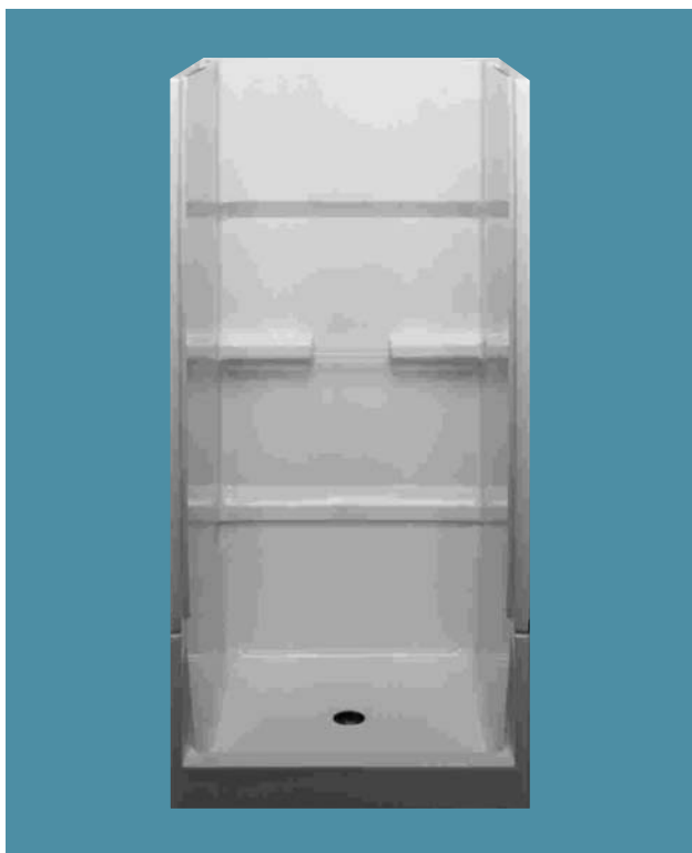
MODEL 034-1975 Center Drain